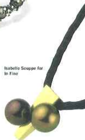
Isabelle Soupe for In Fine