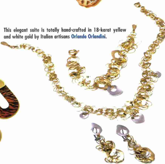
This elegant suite is totally hand-crafted in 18-karat yellow and white gold by Italian artisans Orlando Orlandini.