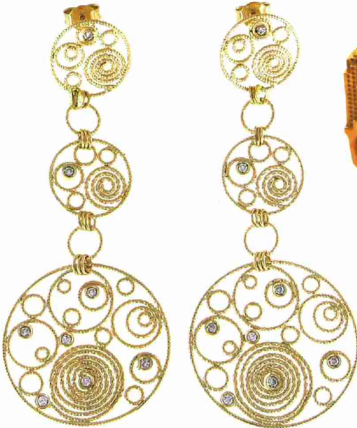
Roberto Coin Moresque Earrings in 18K Yellow Gold with Diamonds.

According to the World Gold Council, more and more designers and artists are bridging cultural boundaries in their jewelry designs and embracing the world, transforming inspirations from around the globe into wearable works of art. Additionally a fusion of geometric shapes and an interesting varied mix of form and color come together to entice consumers to buy what will become heirloom items.