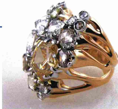
This Federica Rettore ring is crafted in 18K red gold with cognac topaz and rose-cut white and brown diamonds.