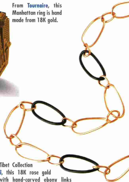
From the Tibet Collection by Mattioli, this 18K rose gold necklace with hand-carved ebony links offers a sophisticated look for all seasons.