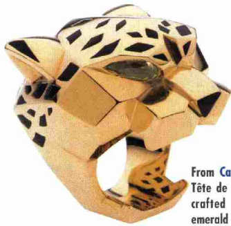
From Cartier, this Bague Tête de Panthère ring is crafted in gold with emerald eyes.