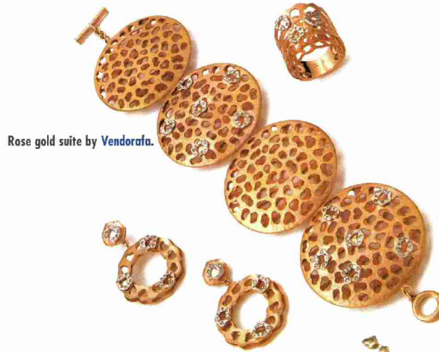
Rose gold suite by Vendorafa.