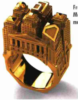
From Tournaire, this Manhattan ring is hand made from 18K gold.