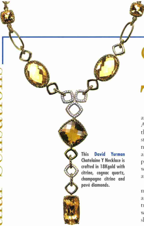
This David Yurman Chatelaine Y Necklace is crafted in 18K gold with citrine, cognac quartz, champagne citrine and pavé diamonds.