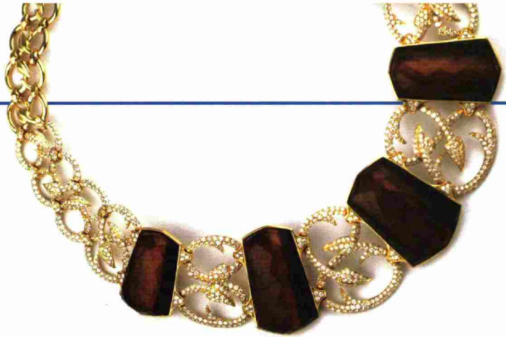
This Stephen Webster necklace offers elegant gold vine work set with diamonds and accented with faceted gems.